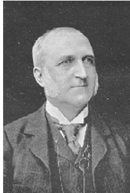
Mr. Chauncey Mitchell Depew

For more information on the Village of Depew, see http://www.villageofdepew.org/history.html .